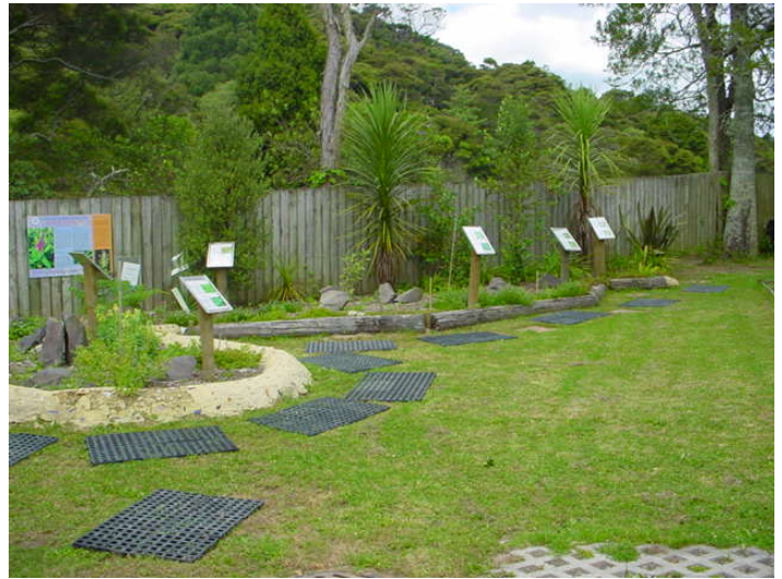
The Birkenhead Community Board has given Kaipatiki permission to use the reserve at the rear of the Centre for growing plants for Eskdale reserve.

Thanks to all involved some fantastic ideas came out of the brainstorming process such as edible gardens, improved and accessible composting/ worm farming facilities and a new hard-standing area for the native plant nursery —all great opportunities to do some much needed maintenance to the centre.